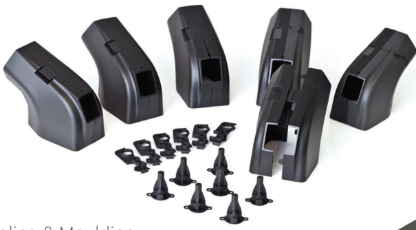
Tooling & Moulding